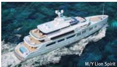
M/Y Lion Spirit

HE: Heat Exchanger, RC: Radiator Cooling, KC: Keel Cooling