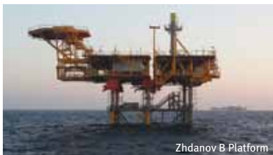
Zhdanov B Platform

HE: Heat Exchanger, RC: Radiator Cooling, KC: Keel Cooling