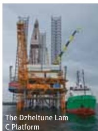
The Dzheltune Lam C Platform

HE: Heat Exchanger, RC: Radiator Cooling, KC: Keel Cooling