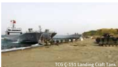
TCG Ç-151 Landing Craft Tank

HE: Heat Exchanger, RC: Radiator Cooling, KC: Keel Cooling