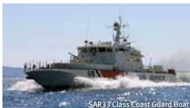
SAR33 Class Coast Guard Boat

HE: Heat Exchanger, RC: Radiator Cooling, KC: Keel Cooling