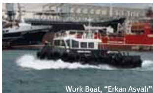
Work Boat, "Erkan Asyali"

Lloyd's Register Type Approval Certificate